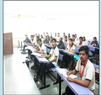
CET – Examination – 2023