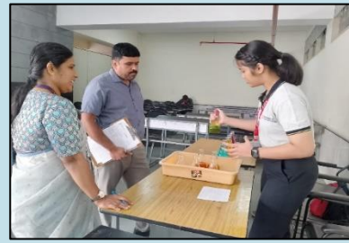
Students Performing Science Experiments