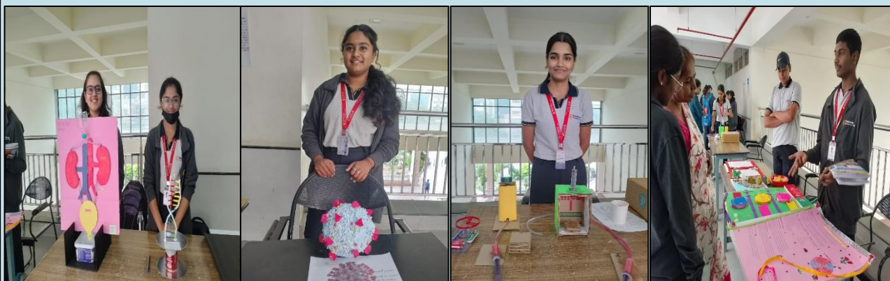
3-D models being displayed by the students