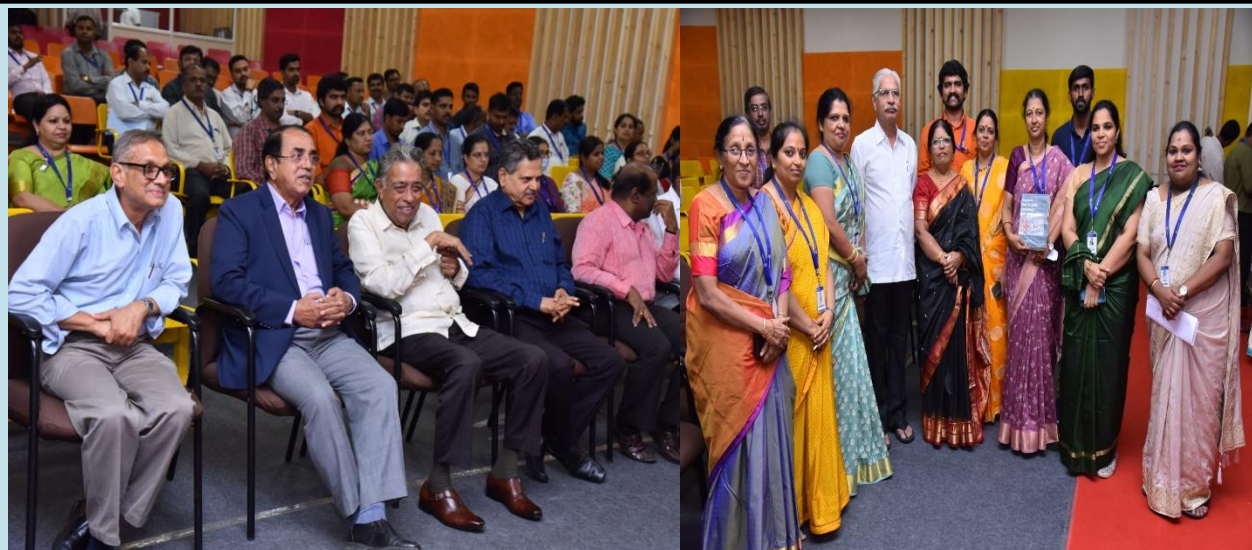
Chairman GEF and other dignitaries during the Gamaka