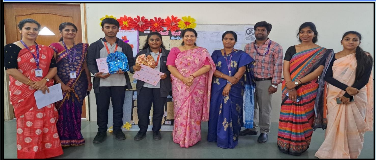
Best Participant group of Millet Chart Making competition