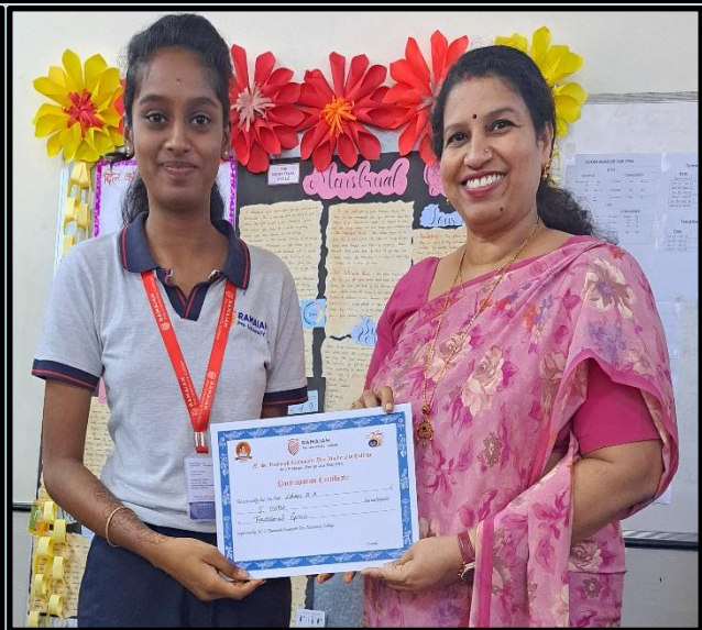
Glimpse of millet fest

On the account of year of millet-2023, RCPUC conducted Millet Festival. Chart Making Competition was held on 25 th of November 2023. The event was a brilliant step towards promoting the benefits of millets and foods which can be prepared by using millets are one of the oldest foods known to humans and possibly the first among cereal grains to be cultivated for domestic purpose.