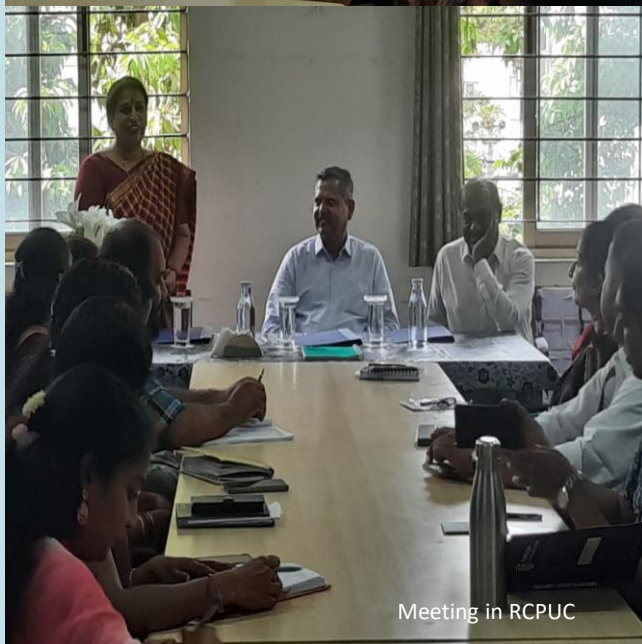
Meeting in RCPUC