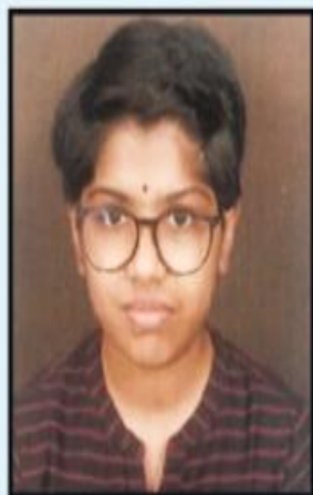
ADTI V. PAI PCMB - 582/600