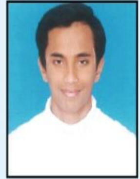
SUNAADA.S HEBA 572/600

There were also many centum holders in different subjects