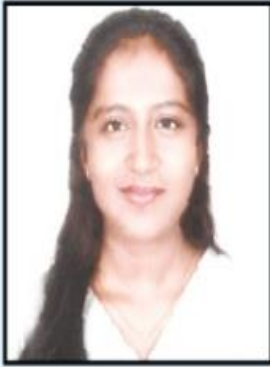
TRUPTI CSBA 581/600