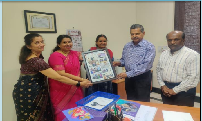
Presentation of greeting card and photo collage depicting memories of CE sir with RCPUC