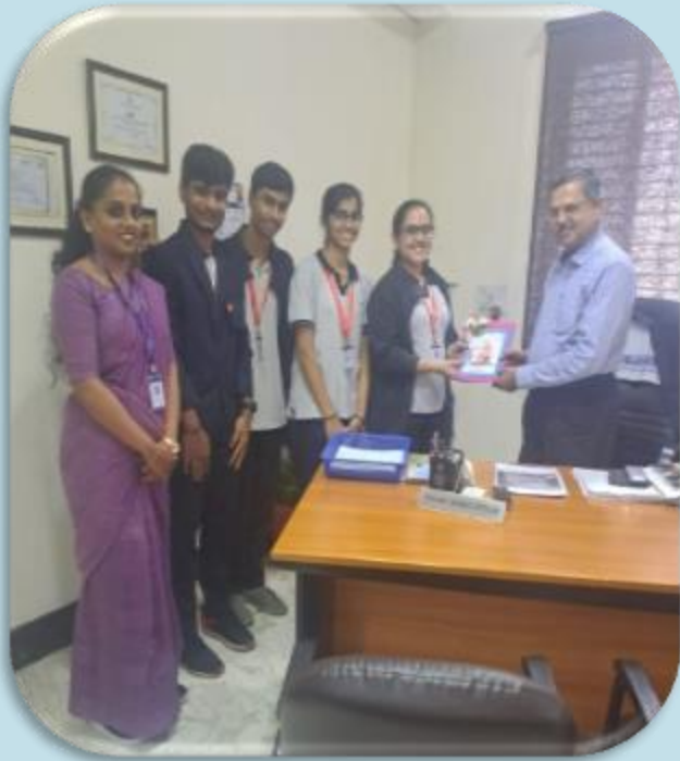
CE , CFO and teachers greeted on the occasion of GURU POORNIMA

TEACHING IS A VERY NOBLE PROFESSION THAT SHAPES THE CHARACTER, CALIBRE AND FUTURE OF AN INDIVIDUAL -Dr APJ ABDUL KALAM