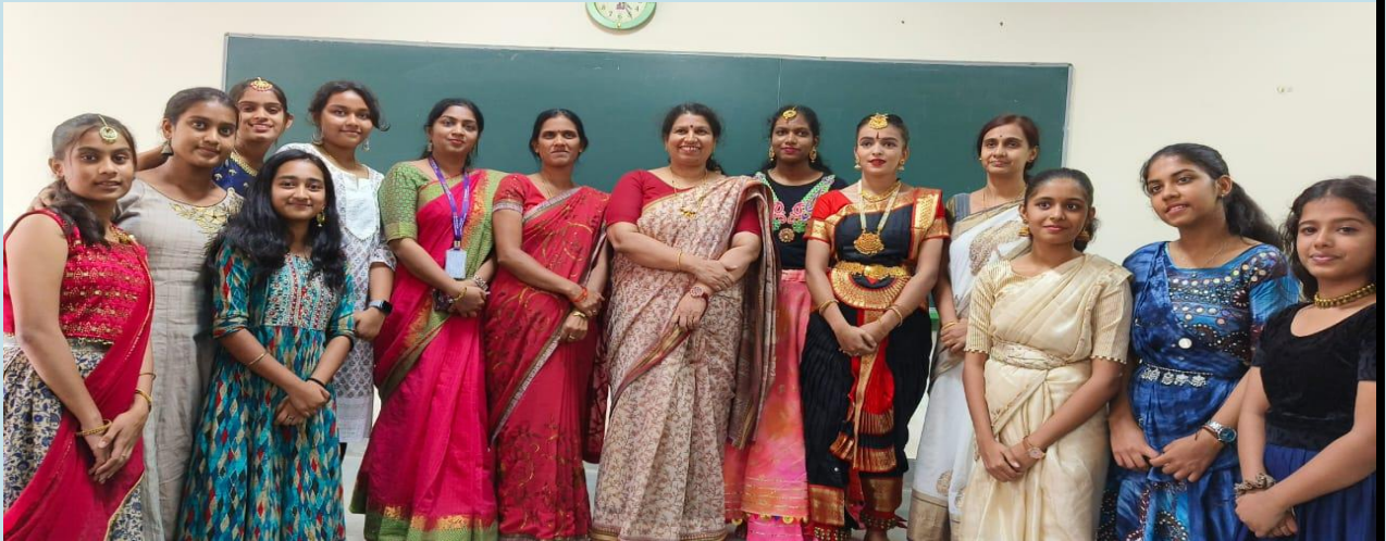
I PUC solo dance competitors posing with the Principal and cultural team

“Winning is something, But participation is everything”